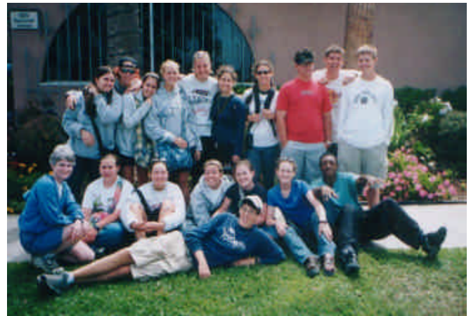
Students and leaders from last summer’s Tijuana mission trip.

No, summer is that special time of year where students are free to not be students, waste away a lazy day and just enjoy being a kid. I’m sure that you have many different things planned for your families during this summer – and hopefully, while you are finishing up (or just starting) your calendars, we wanted to remind you of the things that we have going on here at Central for graduated 5 th through 12 th graders.